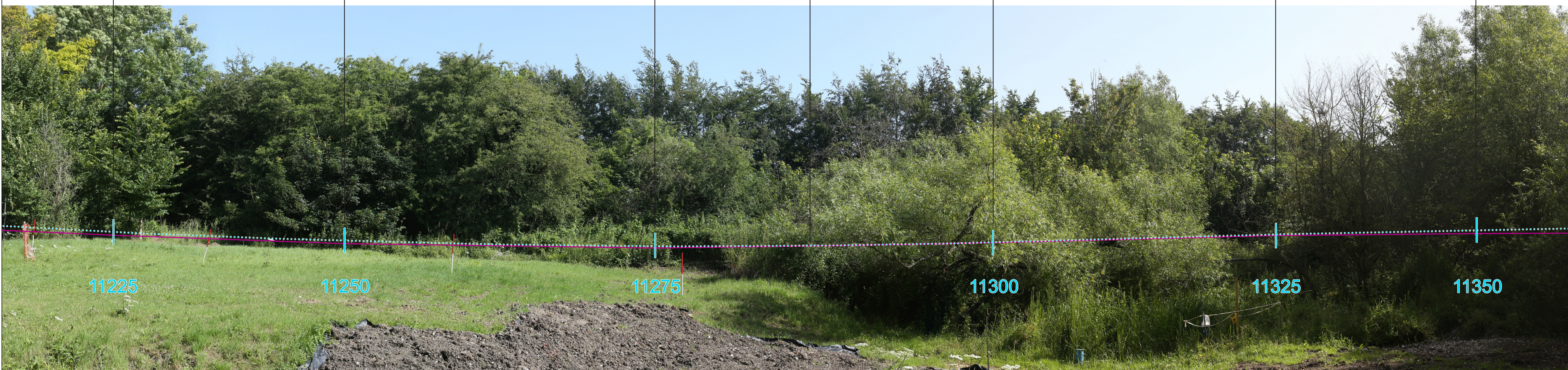
PROPOSED (SUMMER YEAR 15)